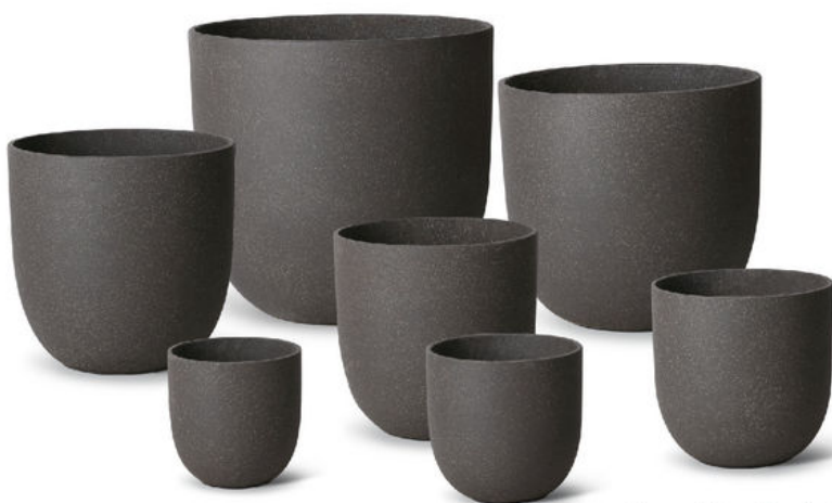
Granito dark brown