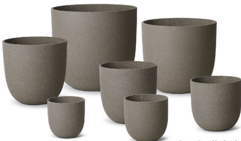
Granito light brown