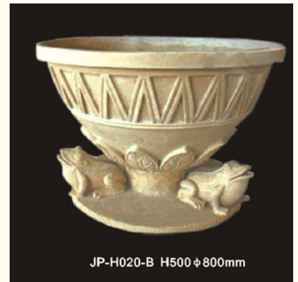
JP-H020-B H500 \phi 800mm