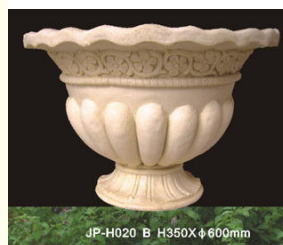
JP-H020 B H350X \phi 600mm